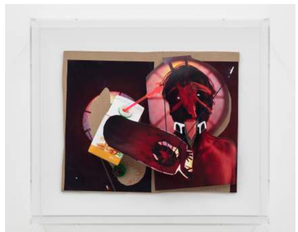
5. John Bock, born 1965 in Gribbohm, lives and works in Berlin untitled , 2017, mixed media, 44 x 51 x 15,5 cm © John Bock, courtesy the artist & Sprüth Magers, photo: Timo Ohler

G2 Kunsthalle Gottschedstraße 2 04109 Leipzig Germany