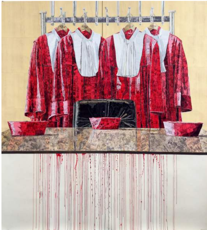
8. Marcel Odenbach, born 1953 in Cologne, lives and works in Berlin, Cologne and Cape Coast (Ghana) Abgelegt und Aufgehungen , 2013, collage on paper, 225 x 208 cm © Marcel Odenbach / VG Bild-Kunst Bonn 2018, courtesy Anton Kern Gallery, New York

+49 (0)341 35 57 37 93 info@g2-leipzig.de www.g2-leipzig.de