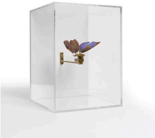
4. Rebecca Horn, born 1944 in Michelstadt, lives and works in Berlin, Paris and Bad König Schmetterling, 2006, butterfly wings, metal construction, motor, 30 x 22 x 22 cm