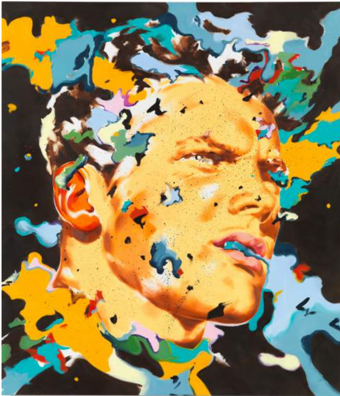
2. Norbert Bisky, born 1970 in Leipzig, lives and works in Berlin Malandro , 2017, oil on canvas, 230 x 200 cm © Norbert Bisky / VG Bild-Kunst Bonn 2018 courtesy the artist & KÖNIG Galerie, Berlin/London photo: Bernd Borchardt