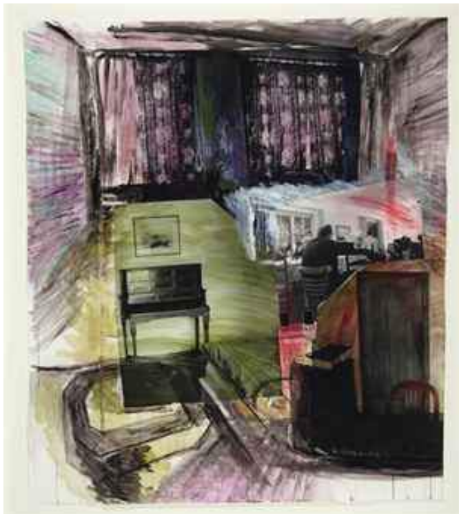
7. Amelie von Wulffen, born 1966 in Breitenbrunn, lives and works in Berlin untitled , 2007, photographs, acrylic, retouching ink on paper, 150 x 130 cm