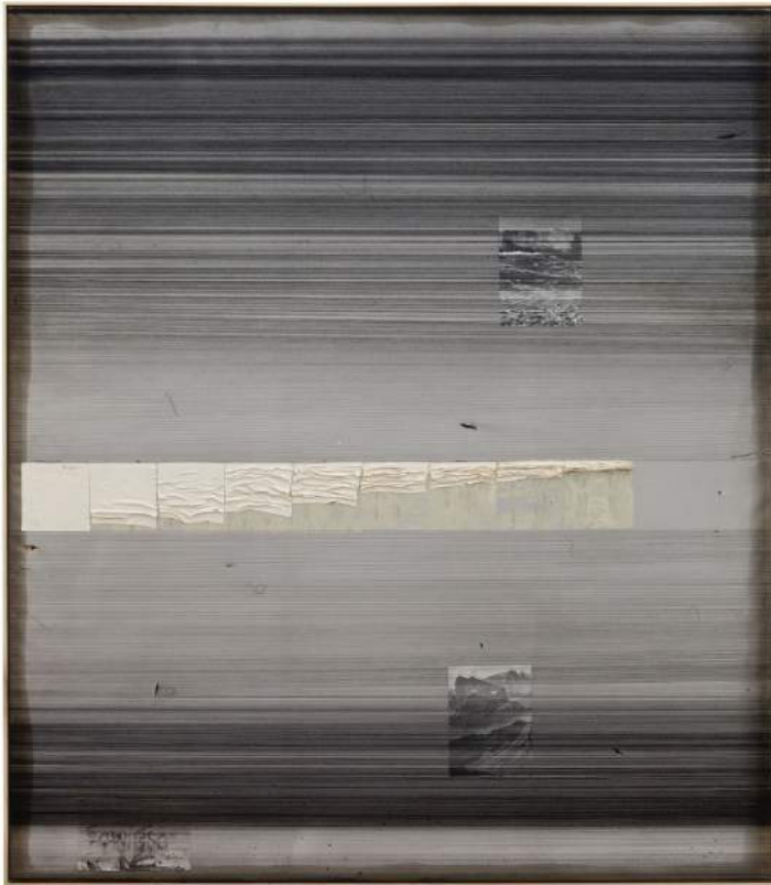
6. Stefan Vogel, born 1981 in Fürth, lives and works in Leipzig Ach - Sowieso -- Genau --- , 2015, textile, linseed oil, glue, photo copies, hot glue, yarn, 230 x 200 cm

+49 (0)341 35 57 37 93 info@g2-leipzig.de www.g2-leipzig.de