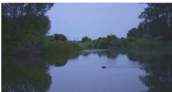
6. Scene from »The Setting«, NARRATION (2016) © Thomas Taube