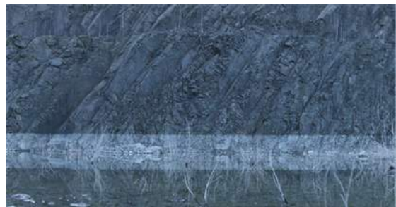
13. Scene from »The Setting« NARRATION (2016) © Thomas Taube