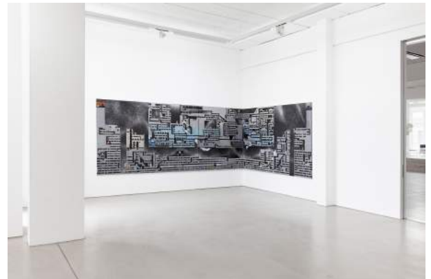
6. Installation view with »Player« (2015–2017, triptych) by Robert Seidel, COLORS OF DESCENTS – Tobias Hild / Julius Hofmann / Robert Seidel, 25 May – 17 September 2017, G2 Kunsthalle Leipzig. © G2 Kunsthalle Leipzig, photo: Dotgain.info for the art work pictured in the image: © Robert Seidel, courtesy the artist & ASPN Galerie, Leipzig