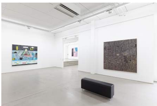
7. Installation view with art works by Tobias Hild & Robert Seidel (right), COLORS OF DESCENTS – Tobias Hild / Julius Hofmann / Robert Seidel, 25 May – 17 September 2017, G2 Kunsthalle Leipzig. © G2 Kunsthalle Leipzig, photo: Dotgain.info for the art works pictured in the image: © Tobias Hild, courtesy the artist © Robert Seidel, courtesy the artist & ASPN Galerie, Leipzig